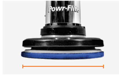
CHOOSE PREFERRED CLEANING PATH Available in 13", 17" or 20" models.