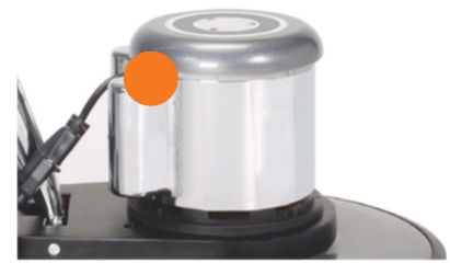
CLASSIC LOOK High-polish chrome finish keeps the Classic looking new longer.