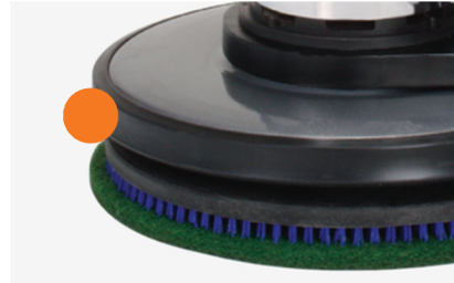
NON-MARKING BUMPERS Full surround non-marking bumpers help prevent damage to walls and furniture.