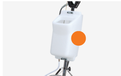
ADD-ON ACCESSORIES Paddle drivers sold separately. Optional 4 gallon solution tank. (Item# FM91).