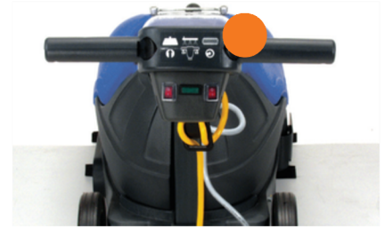
EASE OF USE Control panel on the handle.