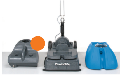
SIMPLE CLEAN/FILL The removable solution and recovery tanks lift off for easy emptying and filling.