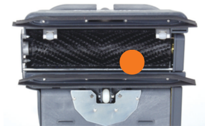
Dual squeegee system and cylinder brush for cleaning all hard floors.