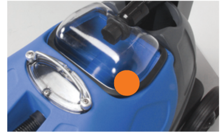
Clear lid for monitoring recovery.